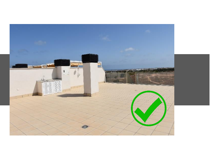
apartments with floor Top exterior kitchen & shower on their own roof terrace with fantastic views! Space prepared for a jacuzzi.