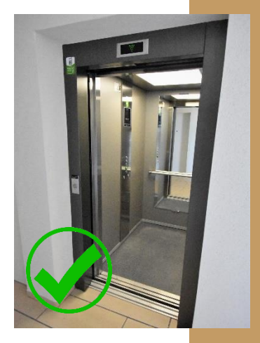
Buildings with 2 lifts